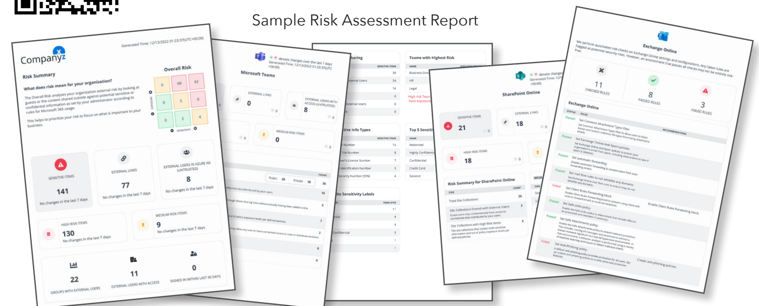
Sample Risk Assessment Report

Although 98% of companies consider data governance critically important, 46% have no formal governance strategy